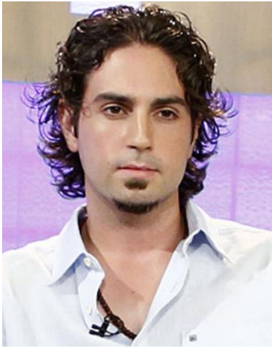
Wade Robson on the Today's Show in May 2013

On May 1, 2013 Wade Robson filed a creditor's claim against Michael Jackson's Estate and a civil lawsuit against Jackson and two of his companies, MJJ Productions and MJJ Ventures, demanding monetary compensation for alleged childhood sexual abuse by Jackson. This was a shocker, since Robson previously had talked about his relationship with Jackson many, many times – whether in Court under oath at Jackson's 2005 trial, in police interviews and in front of a Grand Jury in 1993-1994, or in the media and other platforms – and always defended the star against such allegations and denied that anything like that had ever happened to him.